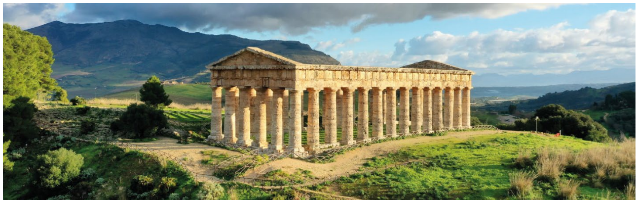
Segesta's Greek temple

Day 9 - Friday, December 1 : Departure from Palermo after breakfast. We motor to the well-preserved and very impressive Greek temple of Segesta, then continue to the picturesque hilltop town of Erice overlooking the Mediterranean Sea. Here we will sample delicious Sicilian pastries produced in the shop established by the quasi-legendary Maria Grammatico. In the afternoon we reach the seaport of Trapani, situated on a long and narrow strip of land jutting out into the sea, where we will stay in the Residence La Gancia , a highly rated four-star boutique hotel located on the waterfront. Dinner of regional specialties, such as Couscous, in a typical ristorante.