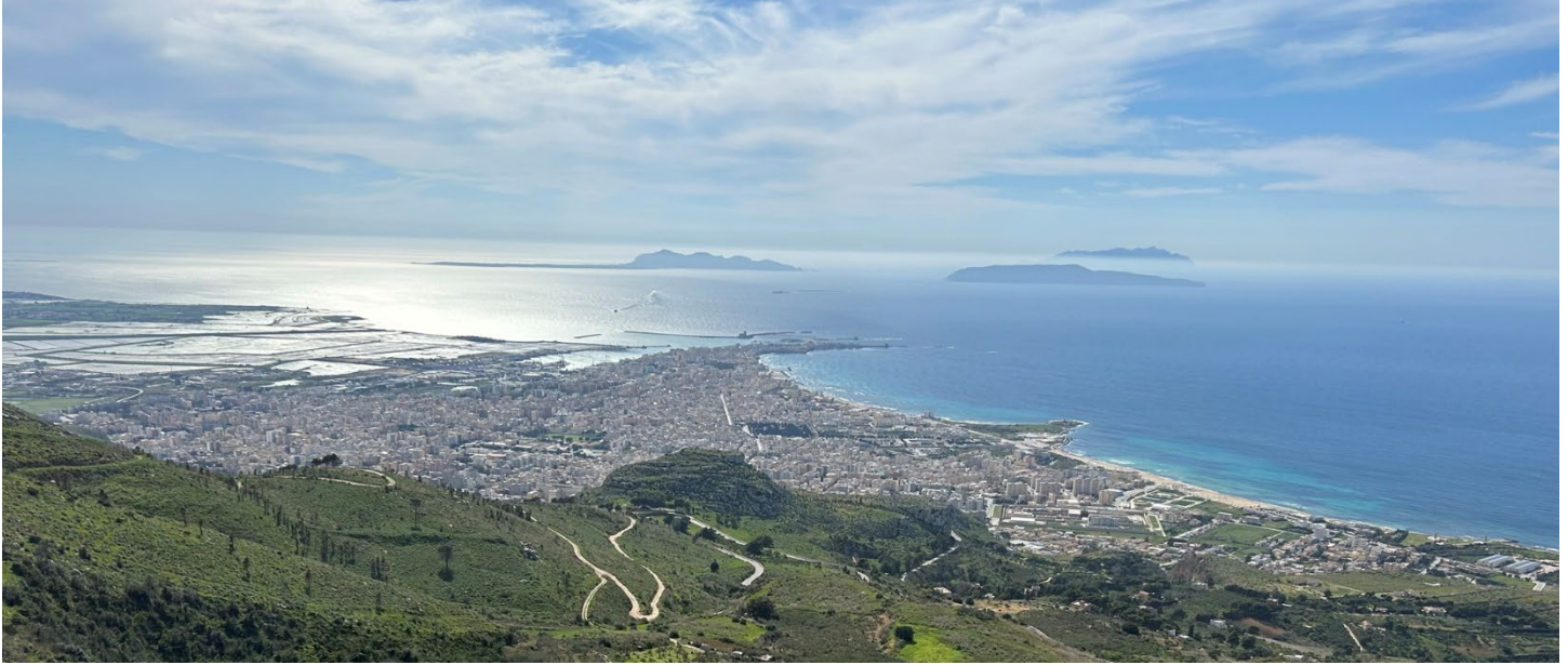
Trapani, the Egadi Islands, and (to the left) the salt flats, as seen from Erice

temples and of course also ranked as a UNESCO World Heritage Site. Dinner and overnight in the first-class Hotel Delle Valle .