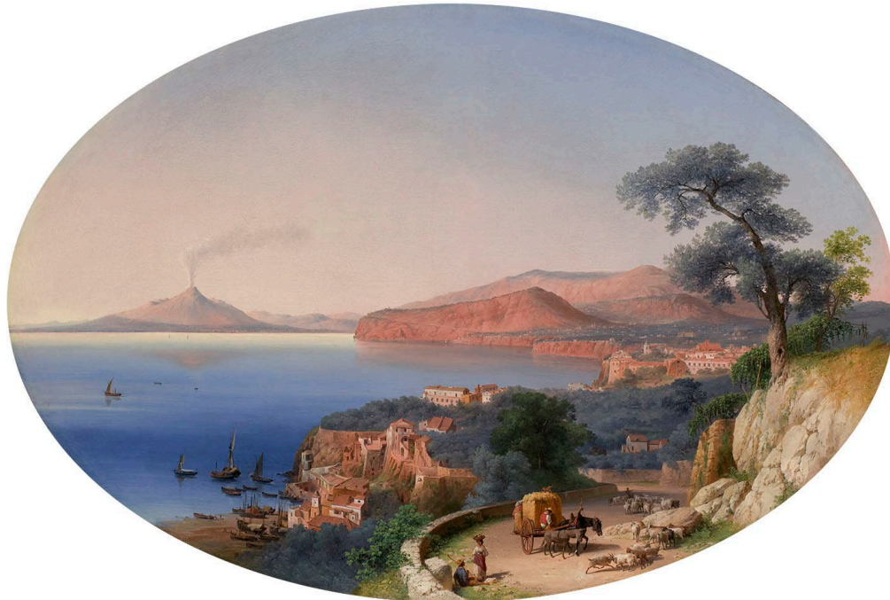
Sorrento and the Bay of Naples, with Mount Vesuvius, on a 19 th -century painting

Pauwels Travel Bureau Ltd. 15 Egerton Street, Brantford, Ontario N3T 4L4 Tel: (519) 753-2695 - Fax: (519) 753-637 tours@pauwelstravel.com – www.pauwelstravel.com