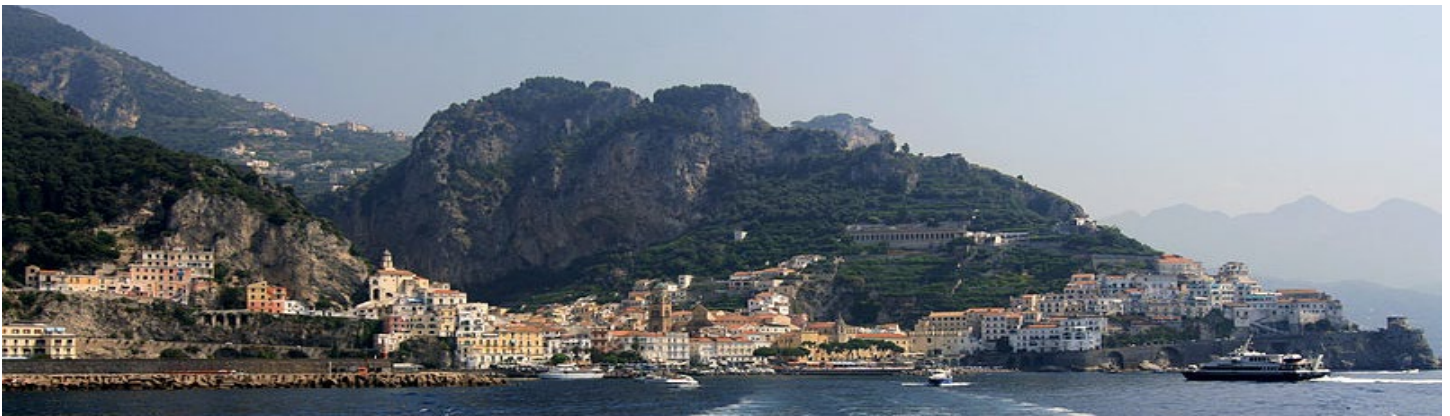
Amalfi from the sea

Byzantine Cathedral, featuring a tomb said to contain the remains of the Apostle Saint Andrew, brought here from Constantinople in 1206, during the Fourth Crusade, when Amalfi was a prosperous and powerful maritime republic. Return to Sorrento in time for dinner in the hotel.