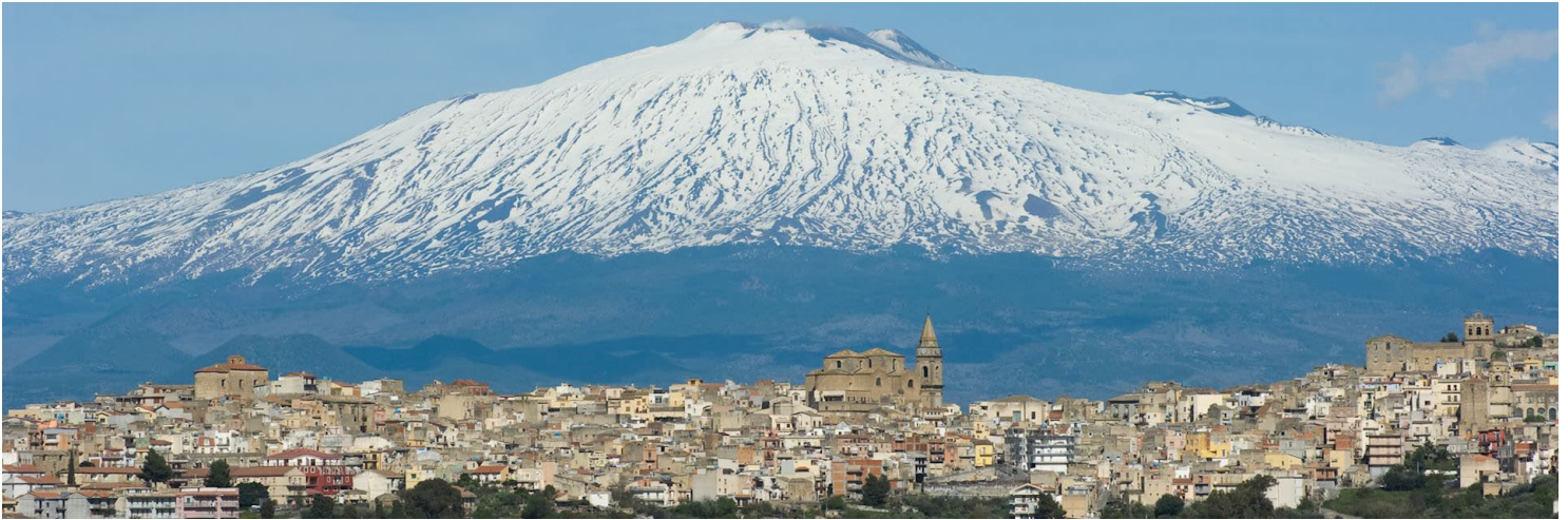
Catania and Mount Etna

Day 15 - Thursday, December 7: After breakfast, short transfer to Fiumicino Airport in time for the 12:55PM departure of our direct return flight to Toronto with Air Canada.