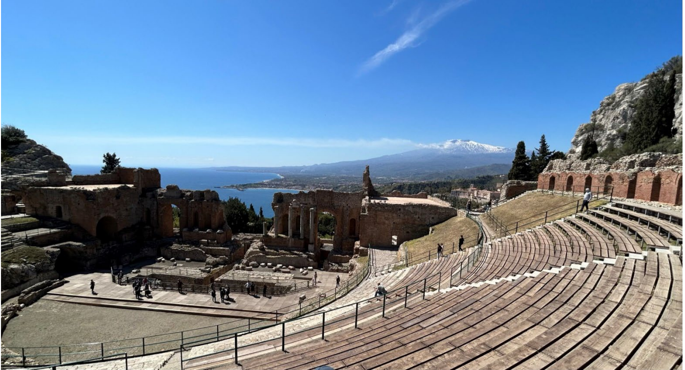
Taormina's Greco-Roman Theatre and Mt Etna in the background

Umberto, the vibrant pedestrian main street. Also, plenty of free time for shopping and individual exploring before we return to our hotel in Giardini Naxos in late afternoon. No group dinner today.