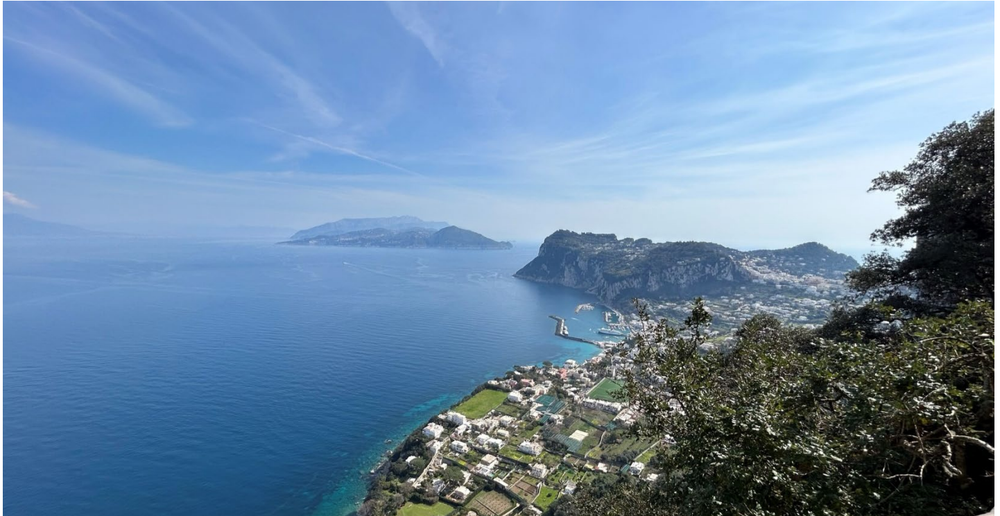
The view from the Villa San Michele in Anacapri, with Capri below; in the distance, the Sorrento Peninsula, and to the left Mt Vesuvius

with stupendous views of the island, the Sorrento Peninsula, Mount Vesuvius, and the entire Bay of Naples! Some free time to shop or enjoy an optional breathtaking chairlift ride up to Monte Solaro, nearly 600m above sea level, where the panorama also includes the Bay of Salerno and the Amalfi Coast. On to the town of Capri for a leisurely walking tour, including the Gardens of Augustus. After the lunch break, free time to explore the town on your own or, if weather conditions permit, enjoy an optional boat tour, either to the famous Blue Grotto or around the island. Return to Sorrento in late afternoon. Dinner in the hotel. (Please note that the Capri excursion is subject to favourable weather conditions.)