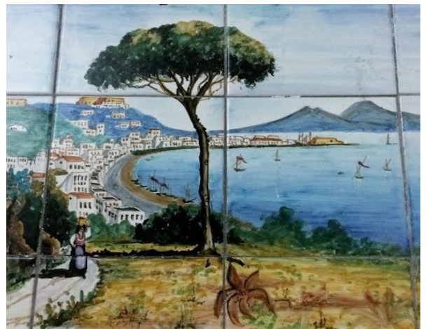
Naples and Mt Vesuvius on a wall in a Naples pizzeria

Day 6 - Tuesday, November 28: Transfer to Naples for a tour of the historical city centre, a UNESCO World Heritage Site, with the former Royal Palace, the famous San Carlo Theatre, and of course the superb National Archaeological Museum, one of the best of its kind in the entire world, if only because it features all or most of the artifacts found during the excavations in Pompeii! Evening departure on the overnight ferry to Palermo, Sicily. Accommodation in cabins with private facilities. Dinner in Naples before departure OR dinner on board.