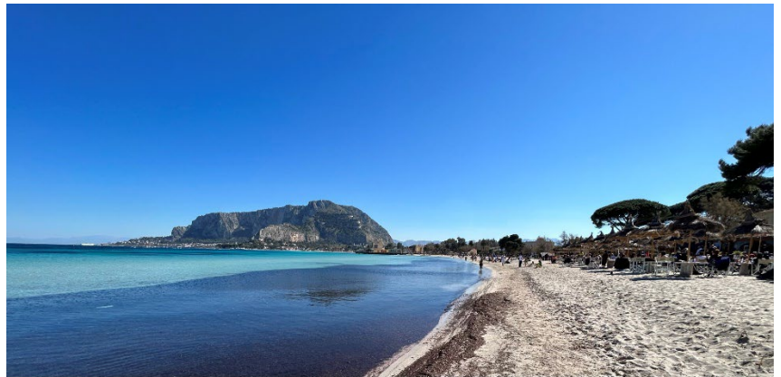
The beach in Mondello (Photo J. Pauwels)

< Mosaics inside Palermo's Palatine Chapel (Photo J. Pauwels)